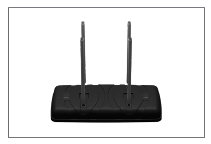
Step 7: Complete.