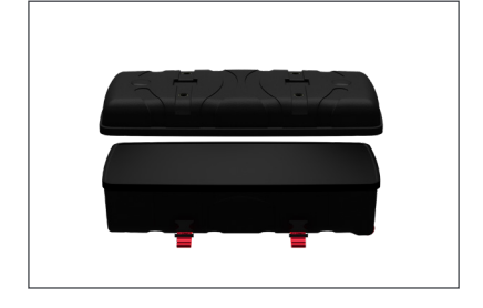
Step 6: Make sure that all wrinkles are out and the fabric looks straight. Put the lid right on top and press to secure.